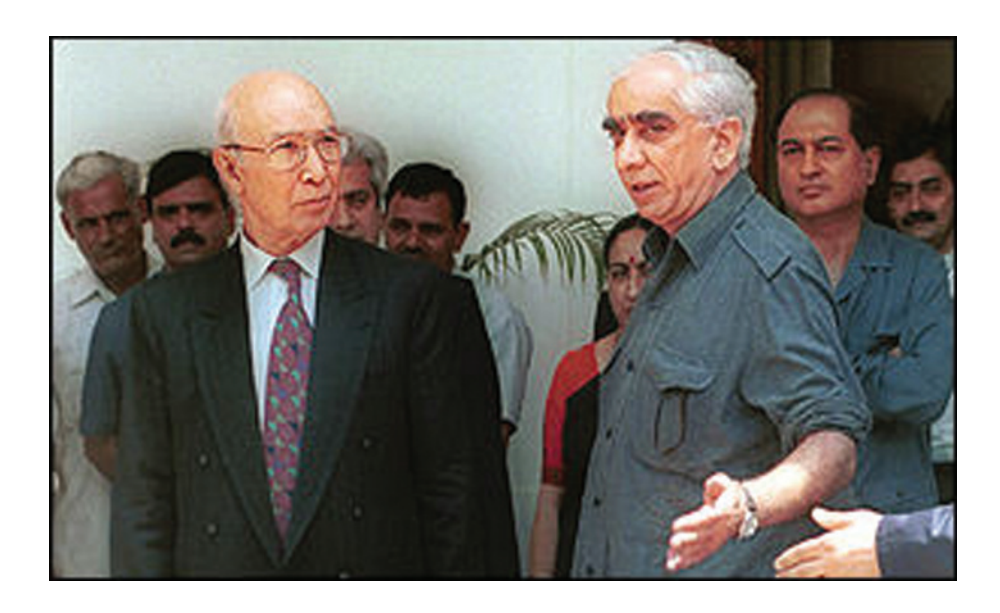
The Foreign Ministers of India and Pakistan during talks on Kashmir, June 1999

Explain why it is so difficult to resolve the Jammu and Kashmir conflict.